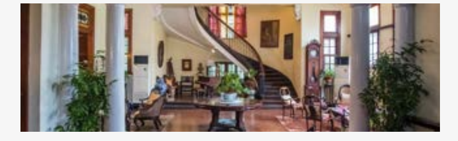
TAKE A STEP BACK IN TIME

Enter this beautifully-preserved mansion and marvel at the artistry of Filipino craftsmen, artists and painters