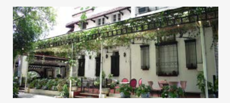
AND THE SOON-TO-OPEN LOBBY CAFE

Located in The Henry Suites MiraNila, this 20-seater cafe is a suitable setting for coffee or brunch or even a romantic evening with our special dinner entrees